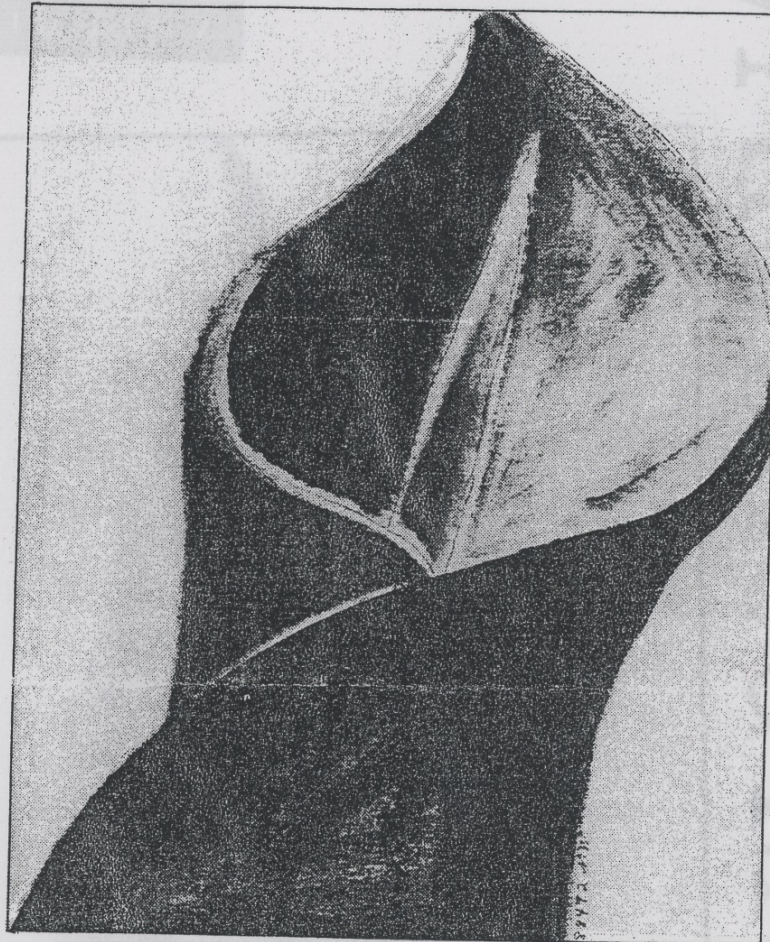
Nan Tull's "Tulip #2."

Drawing is Nan Tull's medium: She handles charcoal, pastel and graphite with bold authority, creating large-scale single images that sometimes threaten to burst the bounds of the paper. Tull's drawings from 1976 to 1993 are the subject of a show in the Wiggin and South Galleries of the Boston Public Library in Copley Square through July 11. Some earlier Tull shows - at the