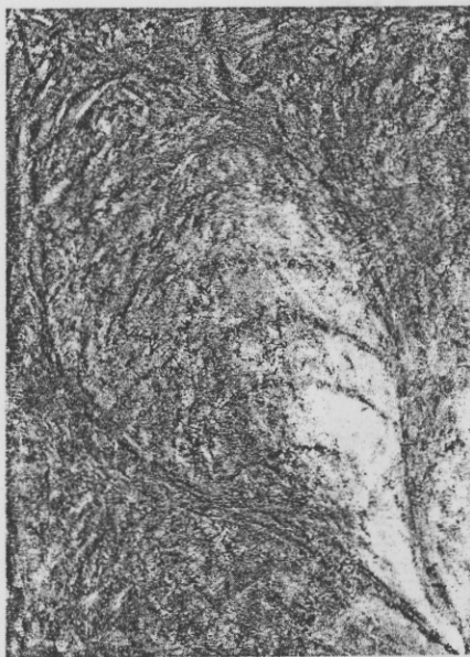
Crossroads II , 1987, oil & wax on linen & canvas, 90" x 53"

The exhibit of Nan Tull's new work will open on October 27 and will be on view through November 25.